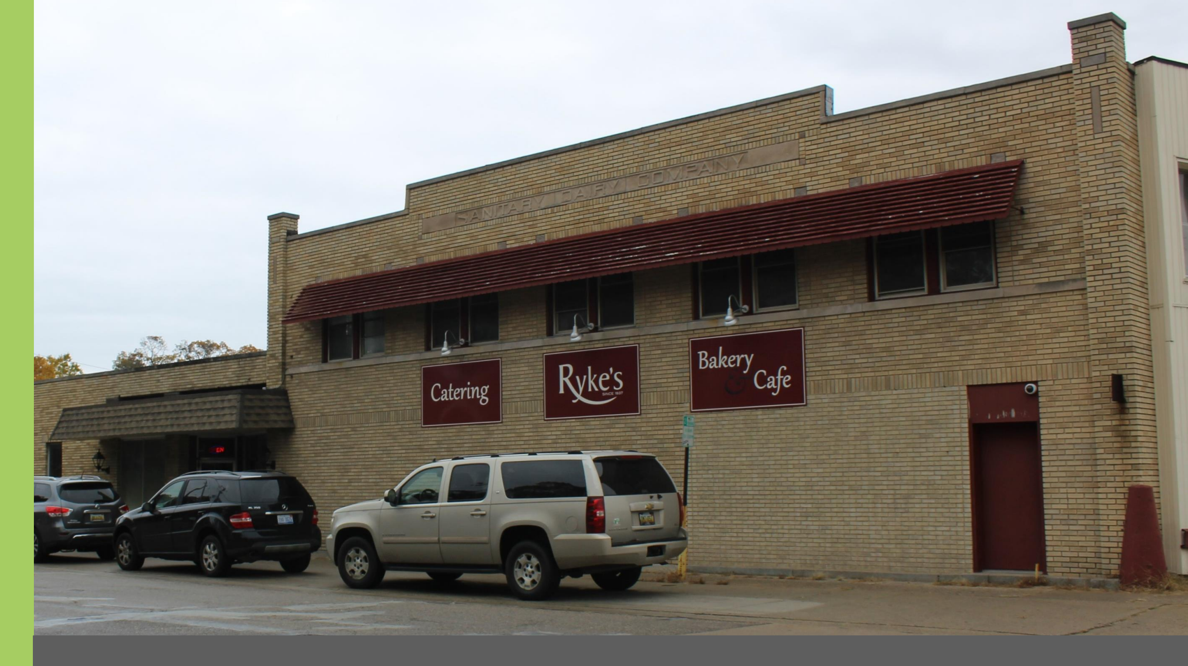
Sanitary Dairy Company | 1788 Terrace Street