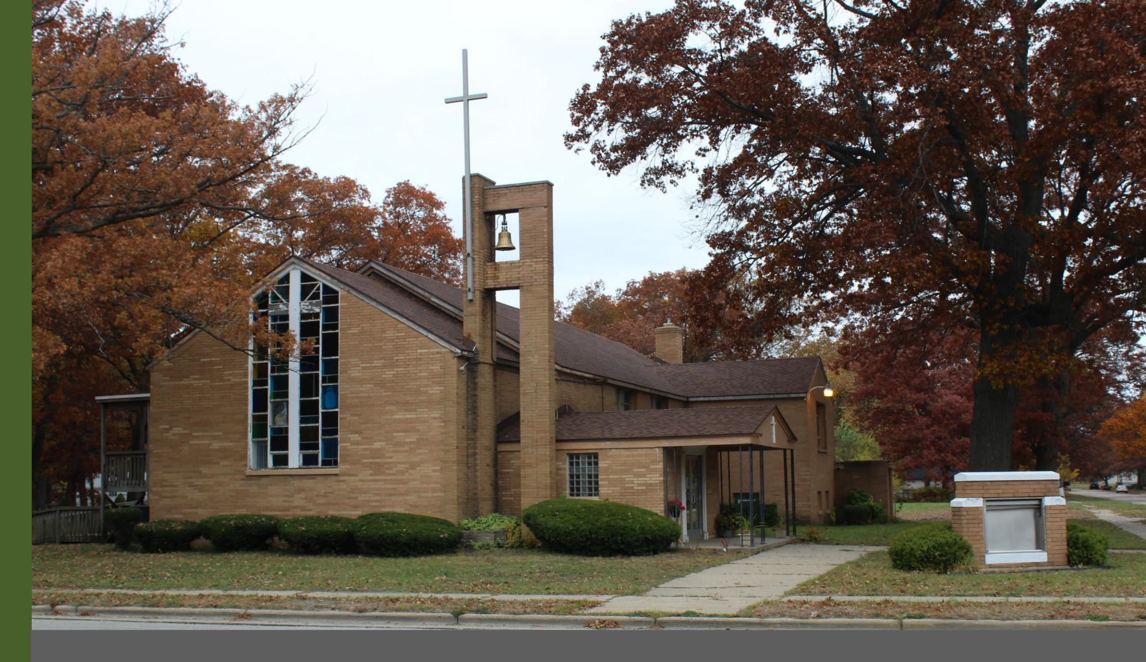
Phillip Chapel AME Church | 2145 Dyson Street