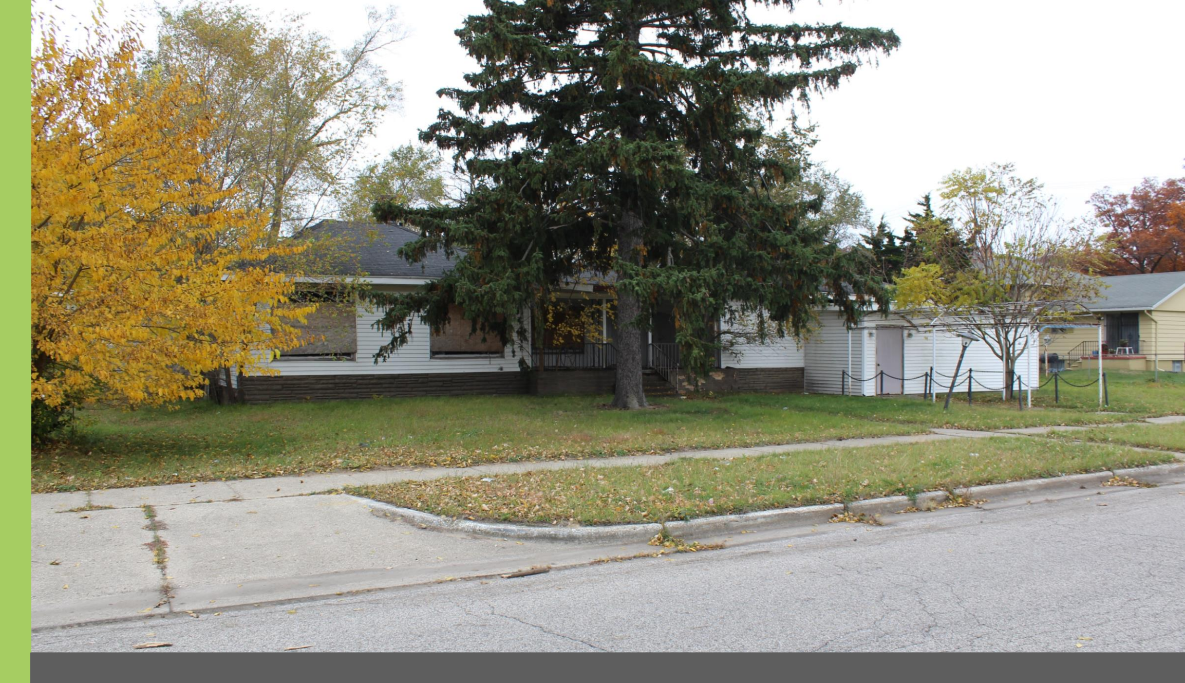
Reynolds Memorial Chapel | 2211 Jarman Street