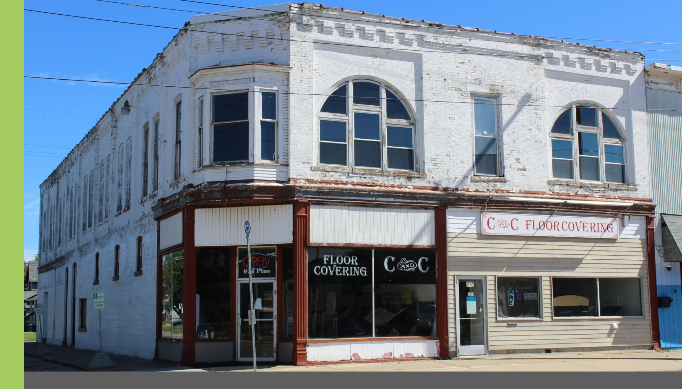
Pine Street Tavern | 974 Pine Street