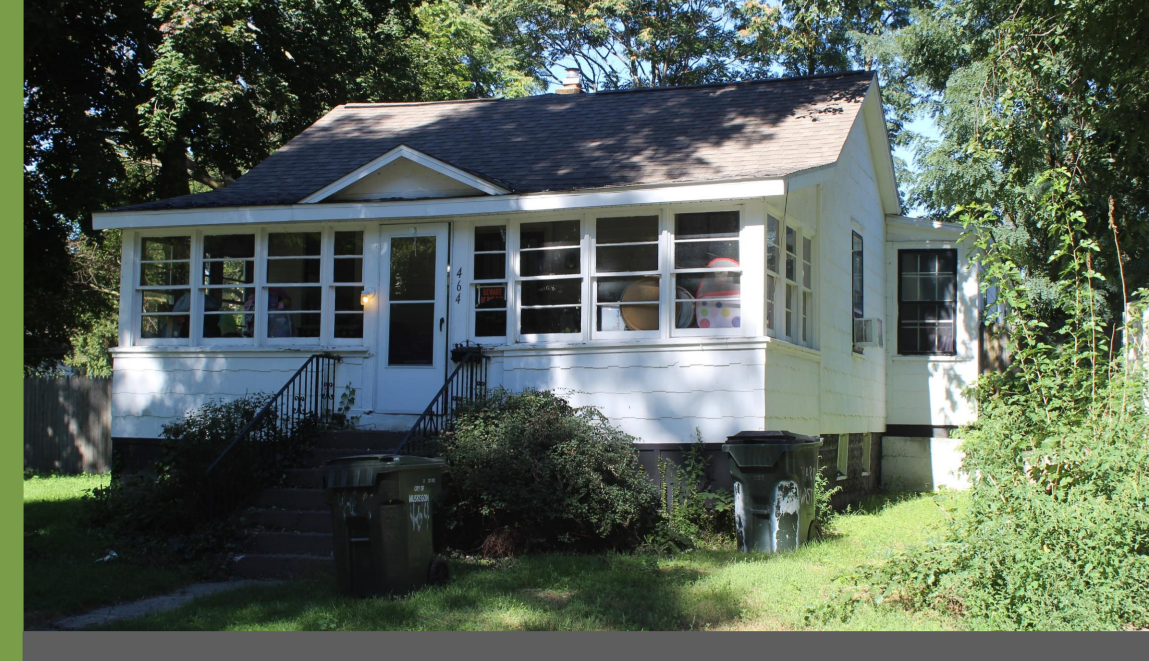
Ruby Brown Tourist Home | 464 Monroe Avenue