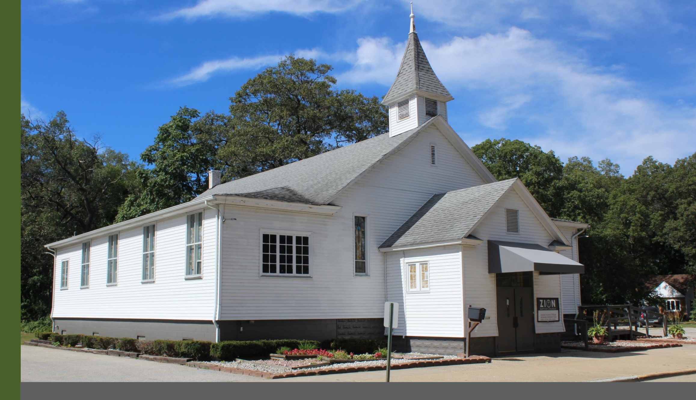
Zion Baptist Church | 375 School Street