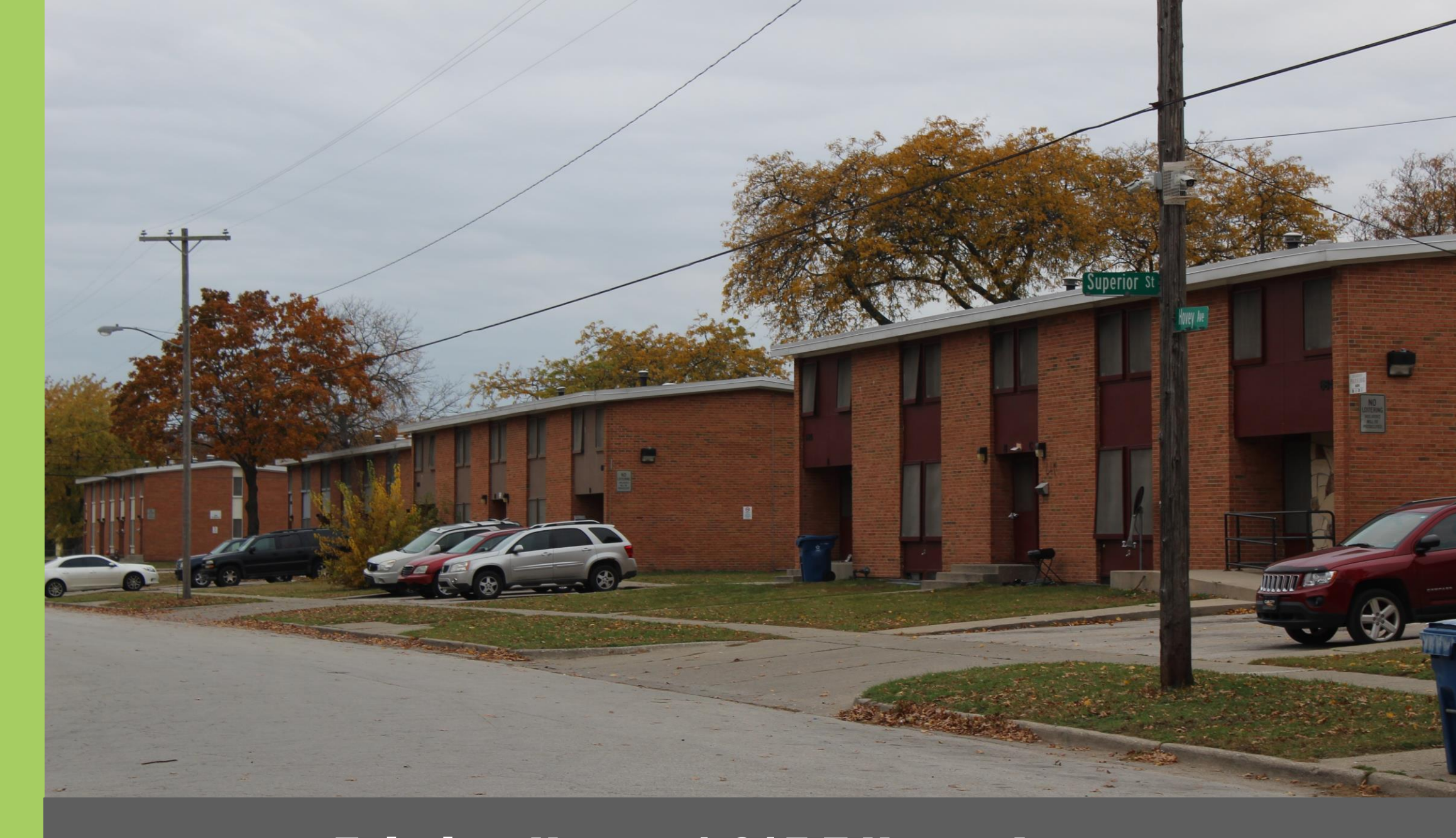
Fairview Homes | 615 E Hovey Avenue