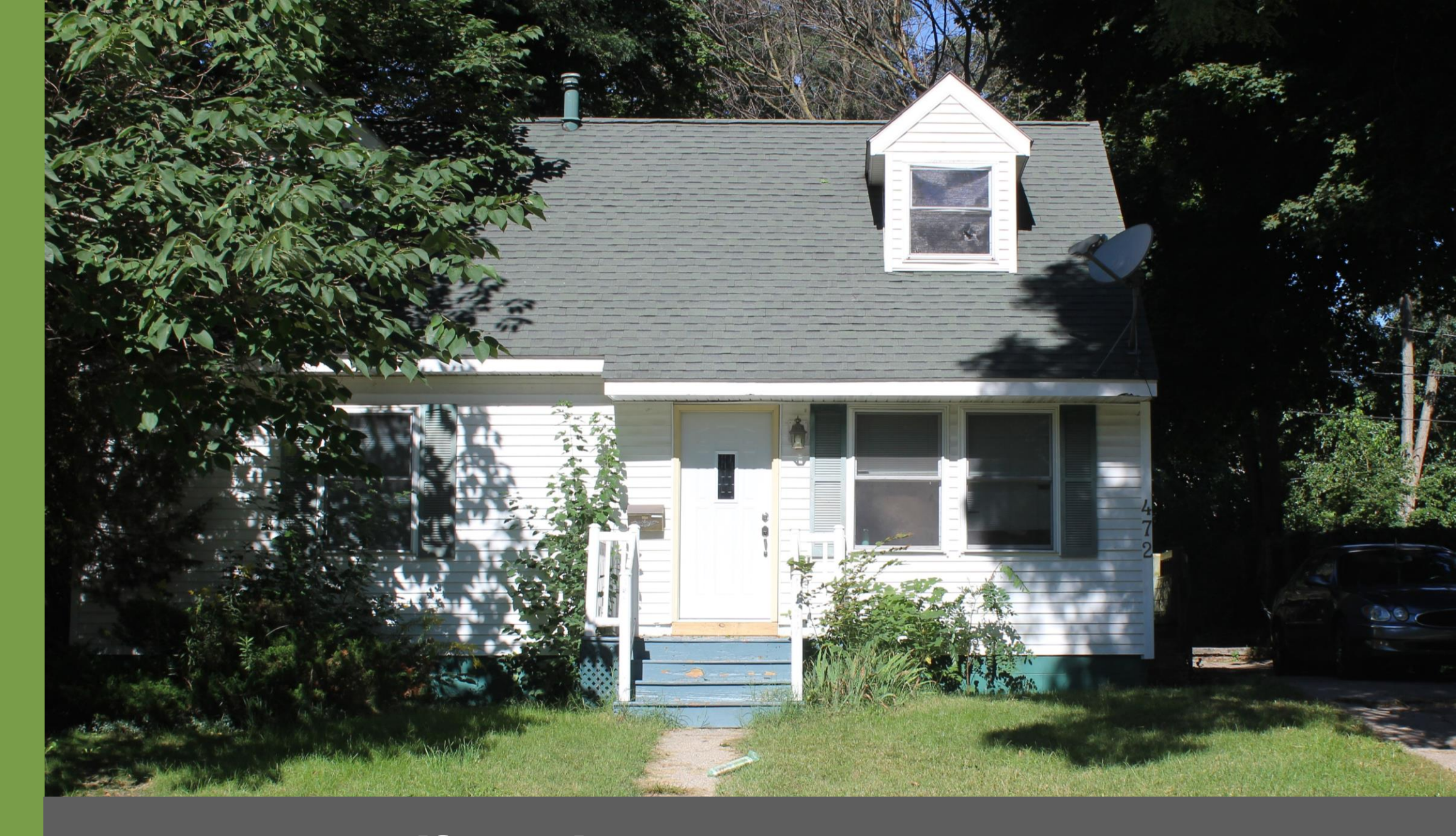
R.A. Swift Tourist Home | 472 Monroe Avenue