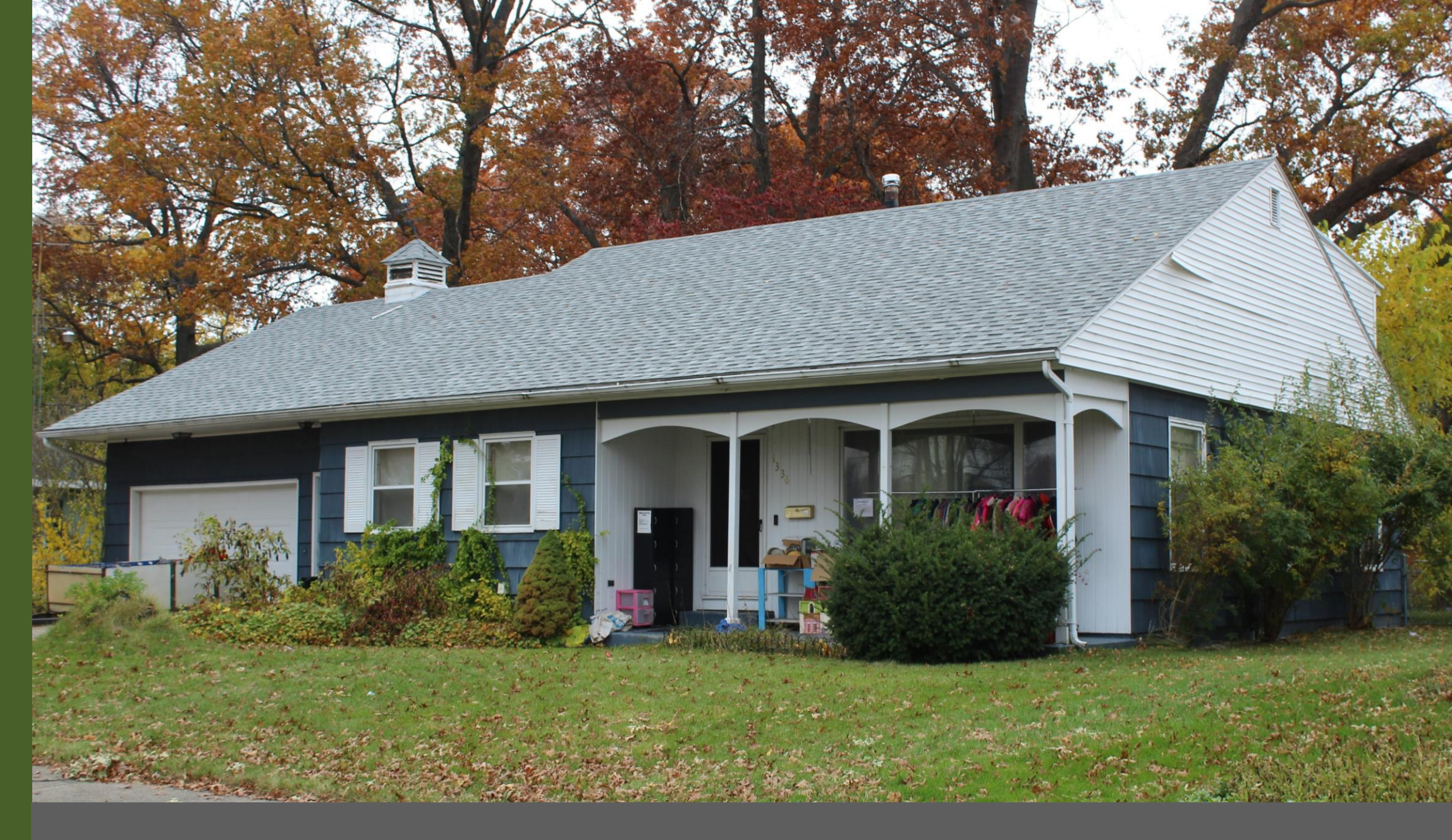
Bethesda Baptist Church Parsonage | 1336 E Forest Street