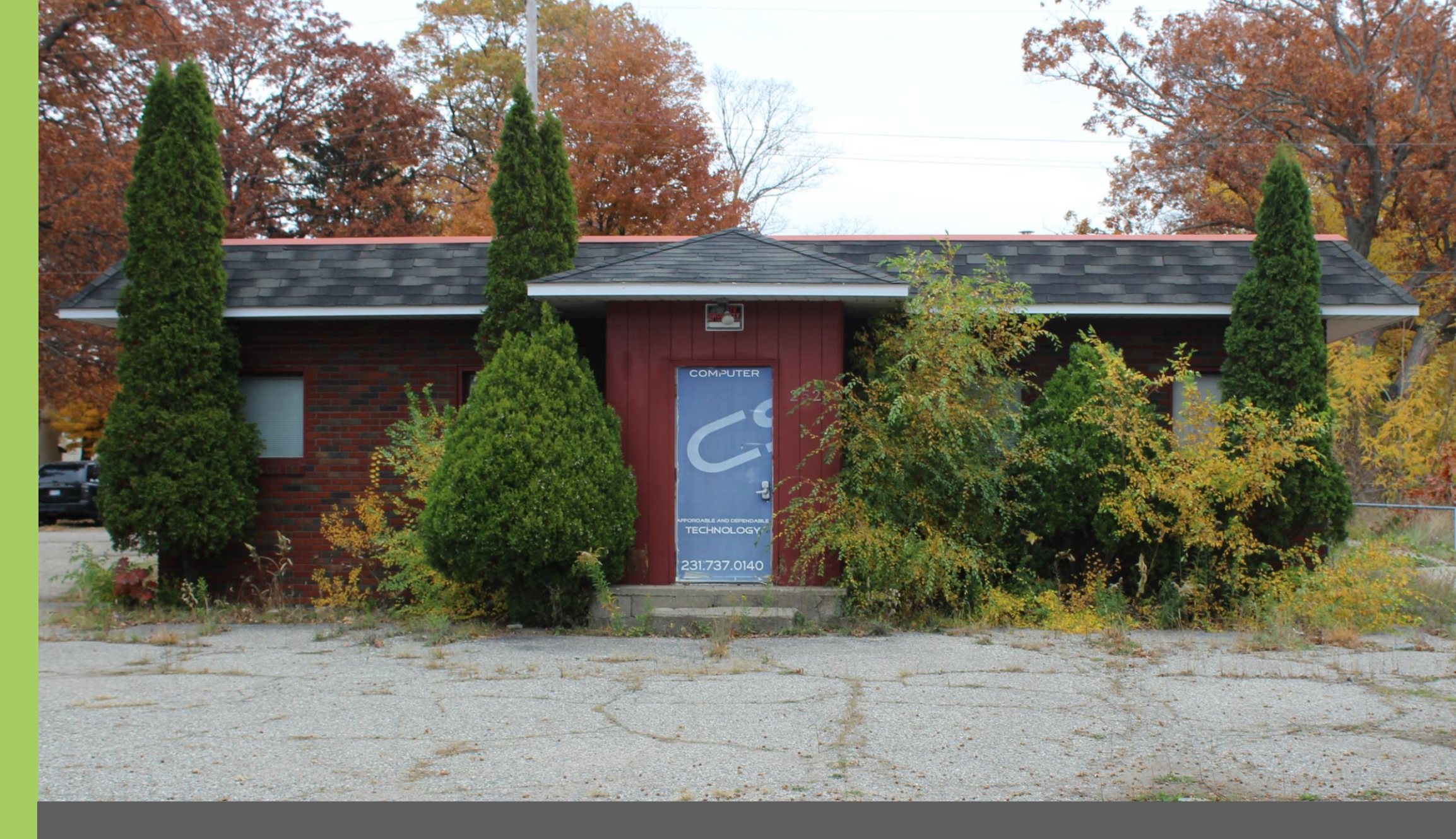
Ciggzree's Real Estate | 2528 Peck Street