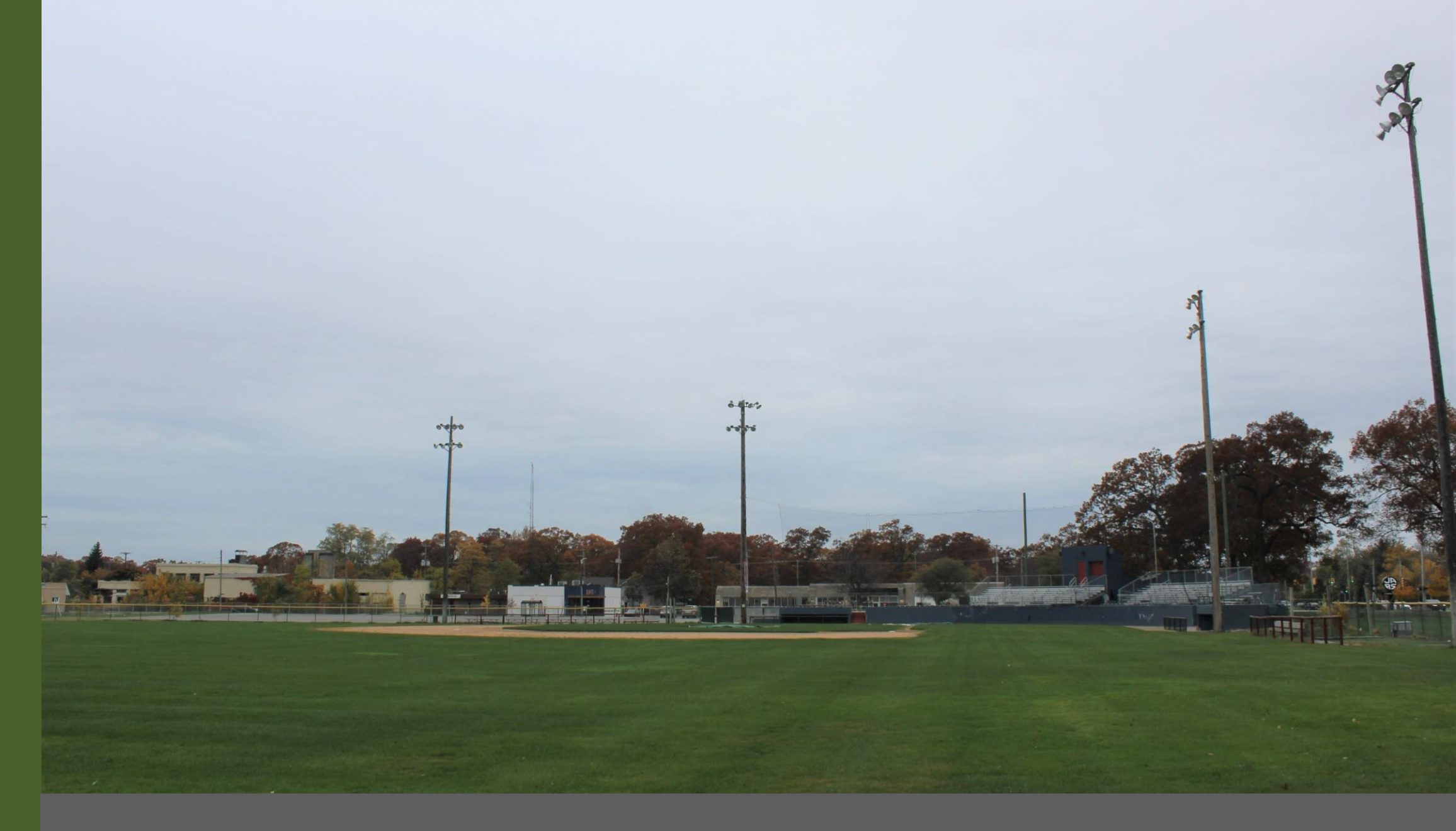
Marsh Field | 1 E Laketon Avenue