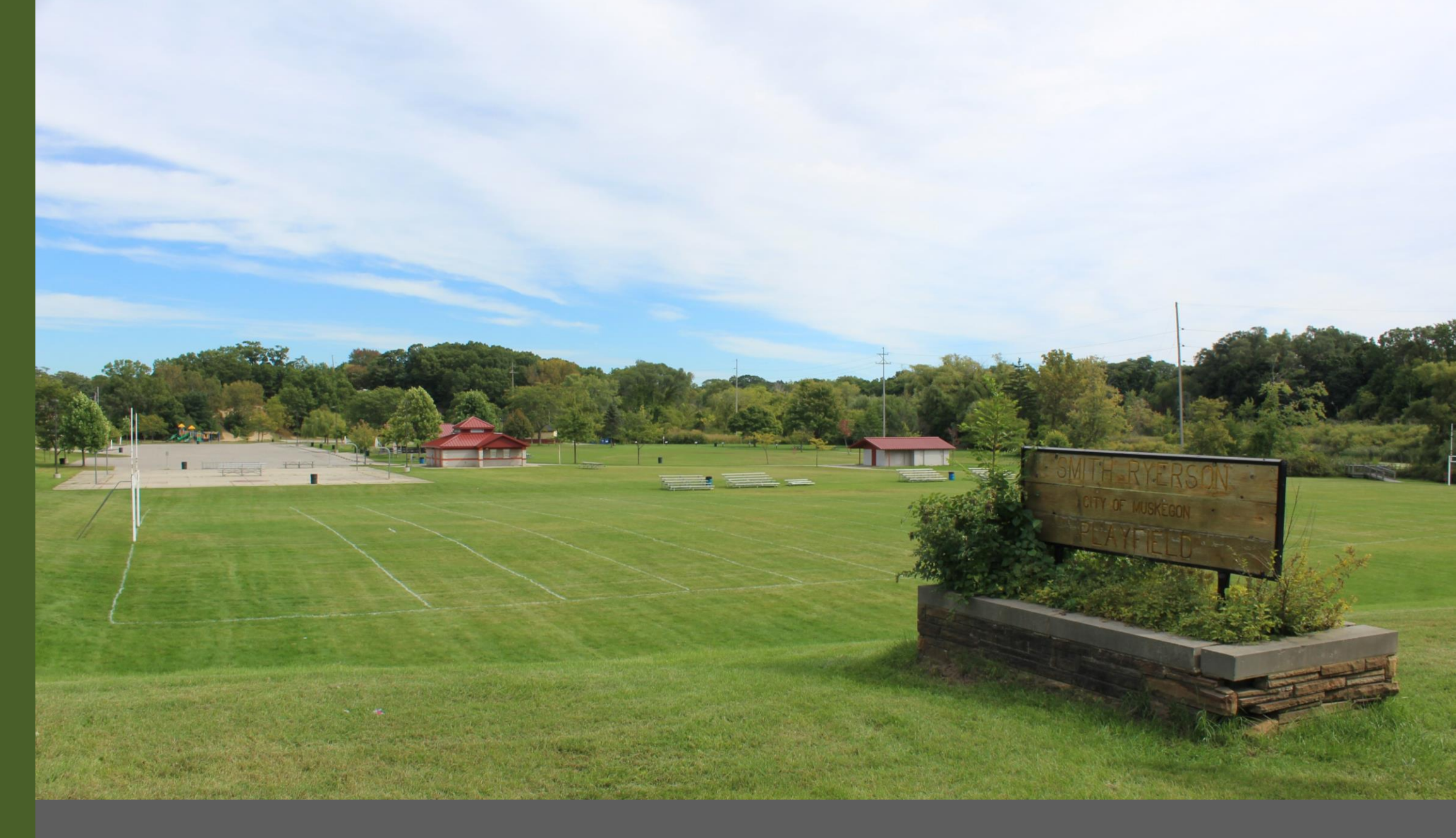
Smith-Ryerson Park | 650 Wood Street